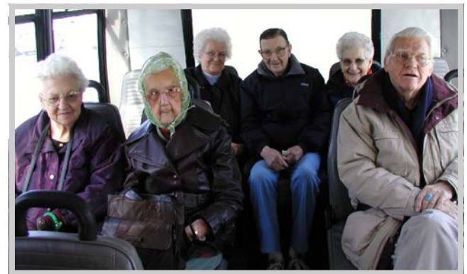
All bundled up and someplace to go! These hardy riders take the Heartland bus to the Ames congregate meal site during the coldest days of January.

We are also grateful for the funding that is provided by private citizens, city, county, federal governments to make these services possible.