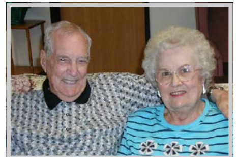
The Zook's of Story City have been volunteering with Heartland's Home delivered meals programs since they arrived in town eight years ago!