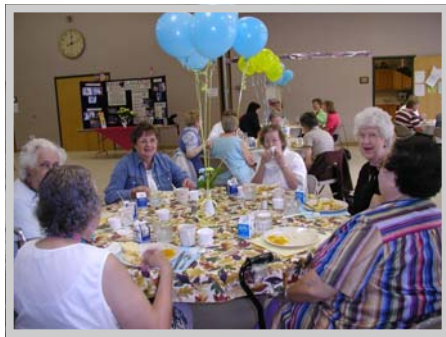
Maxwell Congregate Meal Site celebrated its 25th Anniversary on September 15.